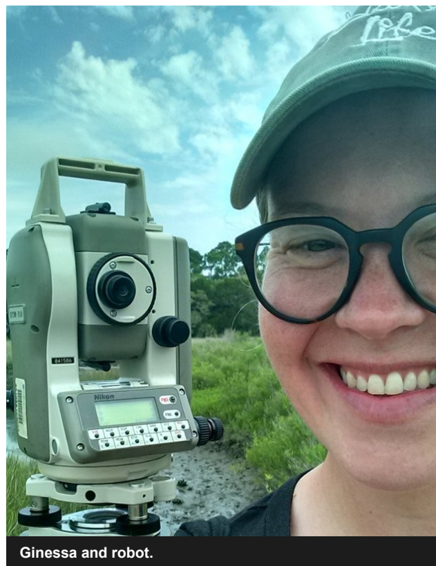
GiNESSa and robot.