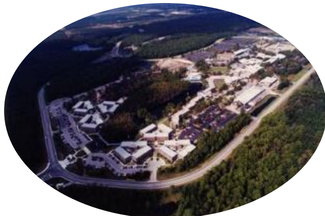
Our 2017 host, as seen from above

More details about the hotel, meeting registration, Sunday tours, and other event activities will be available on the FAS website in January 2017.