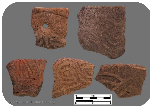
Kolomoki complicated stamped pottery in the Georgia type collection, Ceramic Technology Lab.