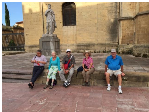
Archaeologists at rest