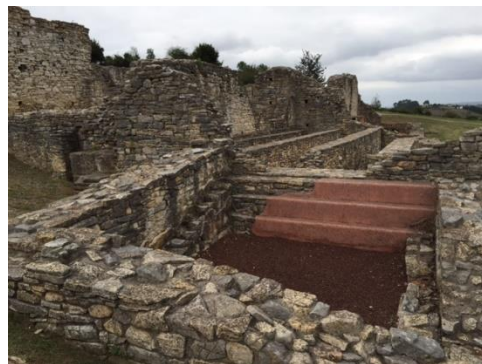
Villa Romana de Veranes