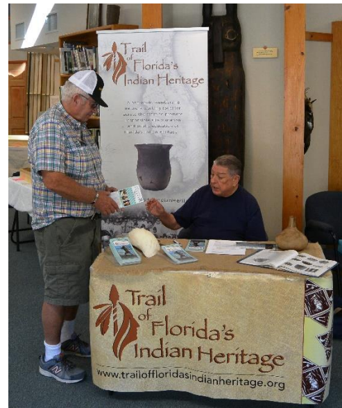
Trail of Florida's Indian Heritage at Silver River in 2016

In 2001, the Trail incorporated as a 501©3 non-profit organization and published its first brochure that featured 16 Sites and 3 Heritage Interpreters.